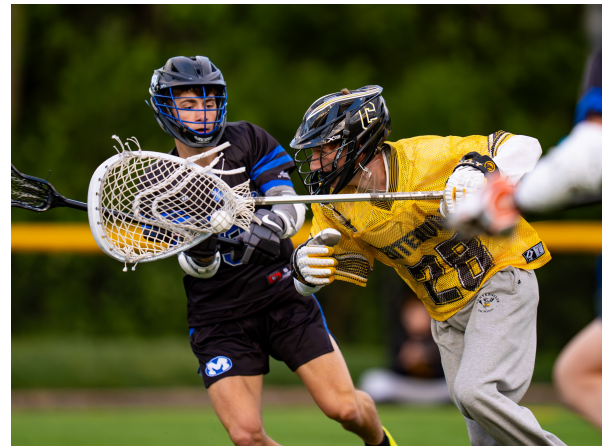
Centerville boys lacrosse — Battle for the Paddle.