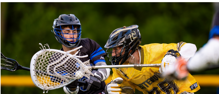
Centerville boys lacrosse — W 8-7 OT Battle for the Paddle.