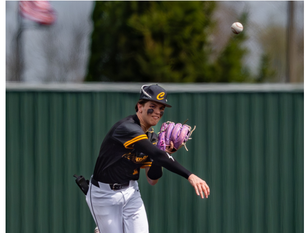
Centerville baseball vs. Anderson.