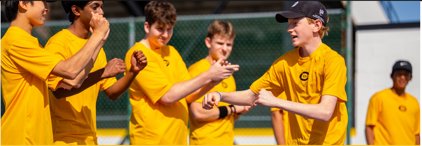
Centerville boys tennis celebrates after sweeping Beaver Creek 5-0 on April 30 — moving to sole first place in the GWOC at 6-0.

Week of April 28 - May 3, 2026 Seven Sports · Spring 2026